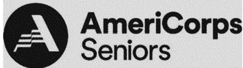
Figure 2 to paragraph (c)

(d) The Seniors Logo contains the word Seniors beneath AmeriCorps, to the right of the circle containing the A.