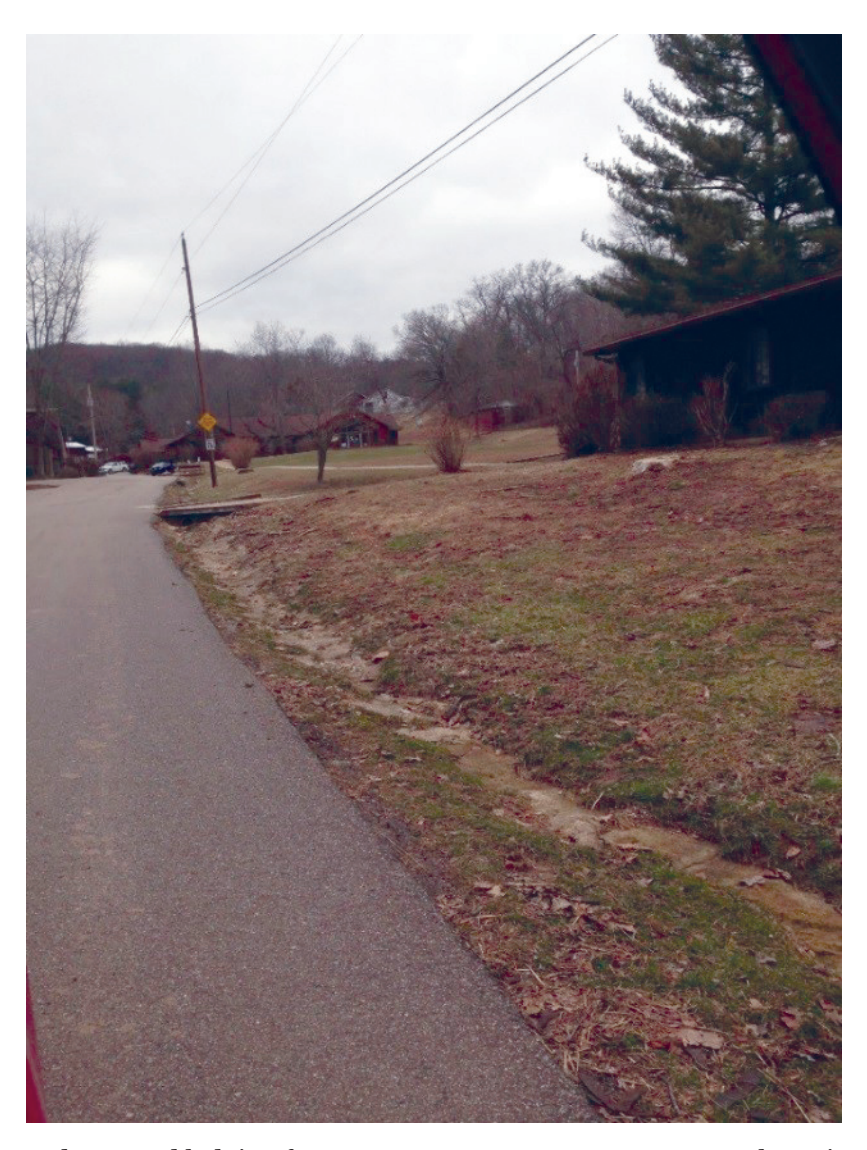
Command post and lodging for A-DRT Teams, Wyman Center, Eureka, Missouri.

Due to the hectic pace for those team members in the initial disaster response, the execution of duties was different in several crucial aspects. The operational period was shortened from seventy-two to twenty-four hours as A-DRT members worked to gain control over the situation, particularly the initial surge of volunteers. Much of this early period was spent coordinating with volunteers, incoming CNCS members, and Volunteer Organizations Active in Disasters (VOADs), as well as establishing the physical infrastructure for the base camp.