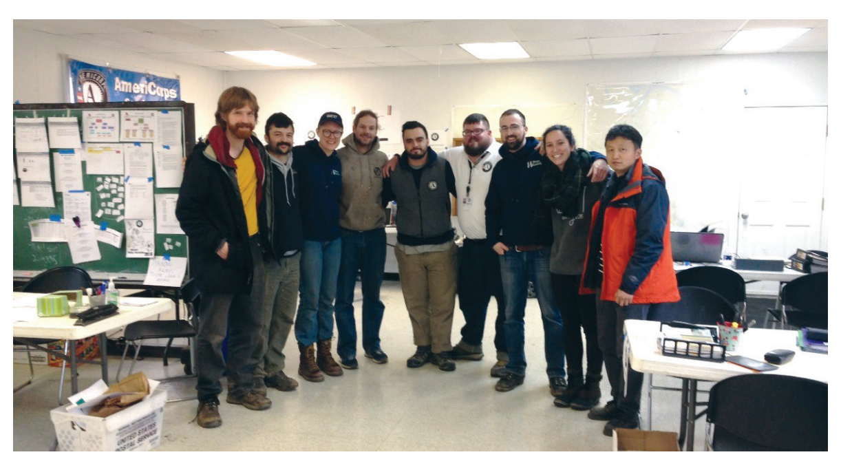
Deputy Commander, AC members, and Indiana University's School of Public and Environmental Affairs Capstone students, Wyman Center, Eureka, Missouri.

The Capstone class saved the raw qualitative information in note form and grouped it into overarching themes for each research area. This method allowed a comparison of experiences among and across members and leaders in the field. By identifying recurring themes, the Capstone class determined successful practices and common challenges under ICS, which drove its recommendations. This analysis led to a much clearer picture of the overall effectiveness of ICS during the Missouri flood.