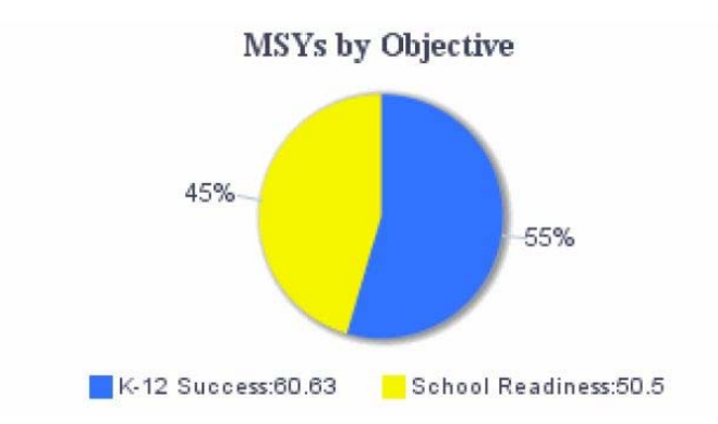
Table2: MSYs by Objectives

Table 2 and its corresponding pie chart show the same MSY information expressed as percentages of the total MSYs: