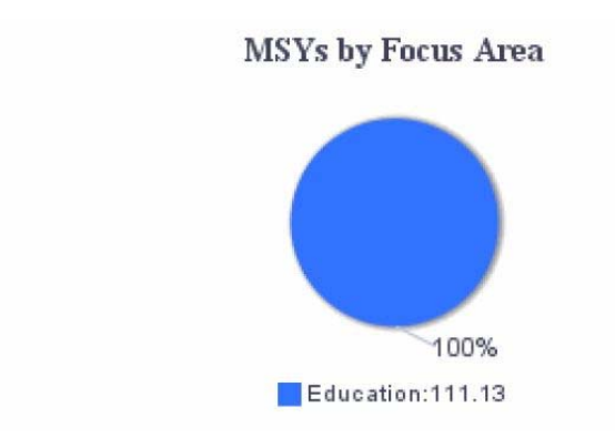
Table1: MSYs by Focus Areas