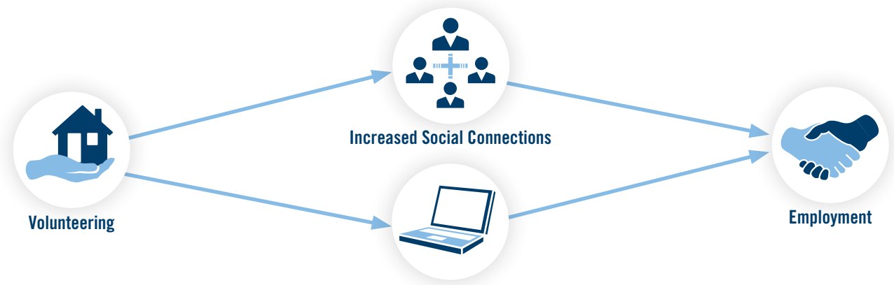
Increased Skills and Experience

Prior research has shown that volunteering can increase a person's social connections (social capital) and skill sets (human capital), two factors that have been shown to be positively related to employment outcomes. In addition, some workers may see volunteering as a possible entry route into an organization where they would like to work. Our results also suggest that individuals with limited skills or social connections — particularly those without a high school education - may see an extra benefit to volunteering, helping to level the playing field.